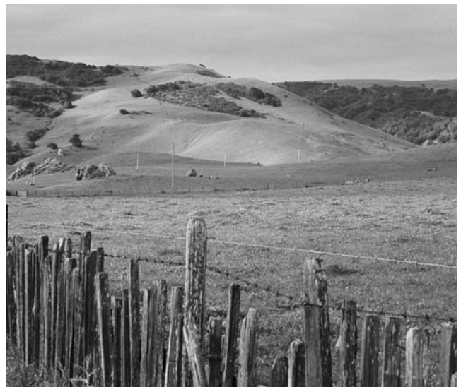
Classic split redwood fences from the past, green pastures of today.

We asked everyone what we could do to help, and found out that 62% of operators wanted consistent help with the permit and regulations process. In answer to that