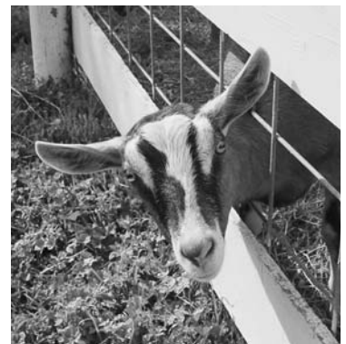
Small animal at Redwood Hill Farm.

This was a rich, informative and entertaining event that opened up new doors of opportunity for both goat and sheep raisers.